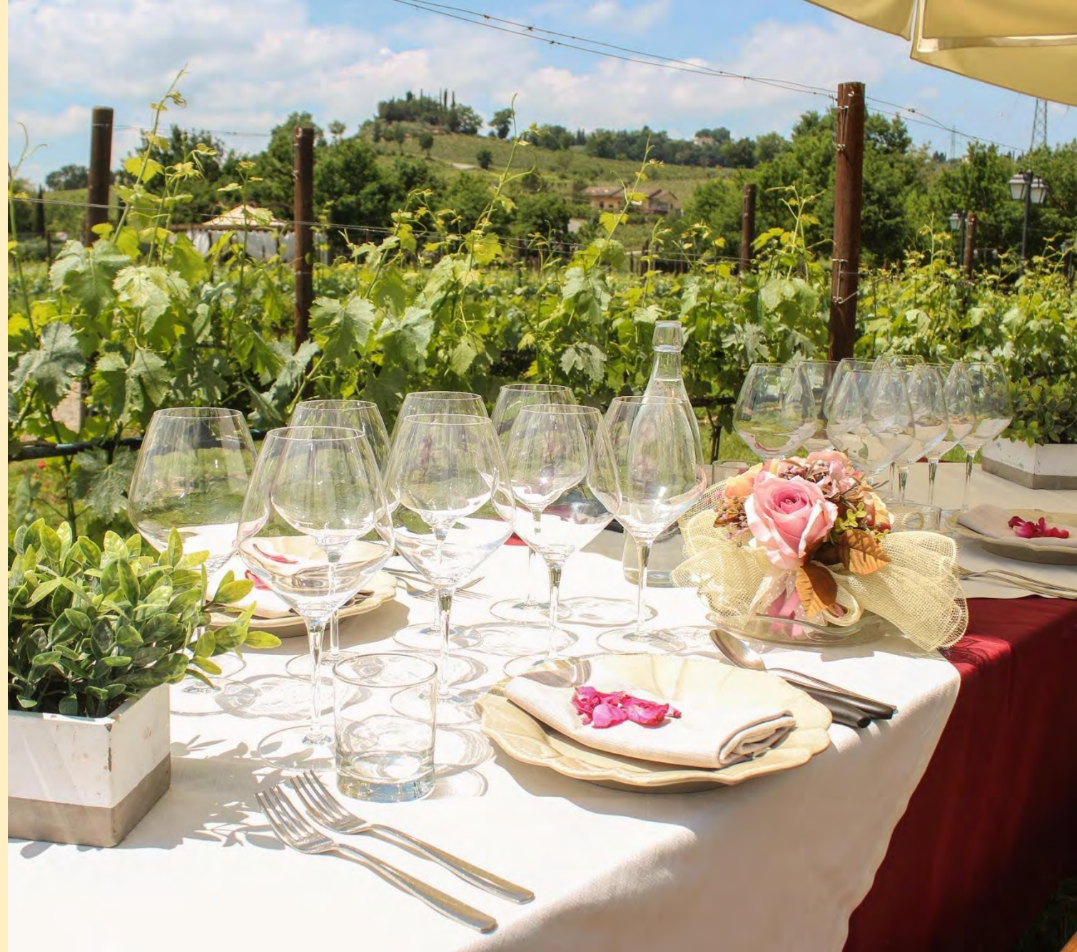
Lunch in our Tenuta