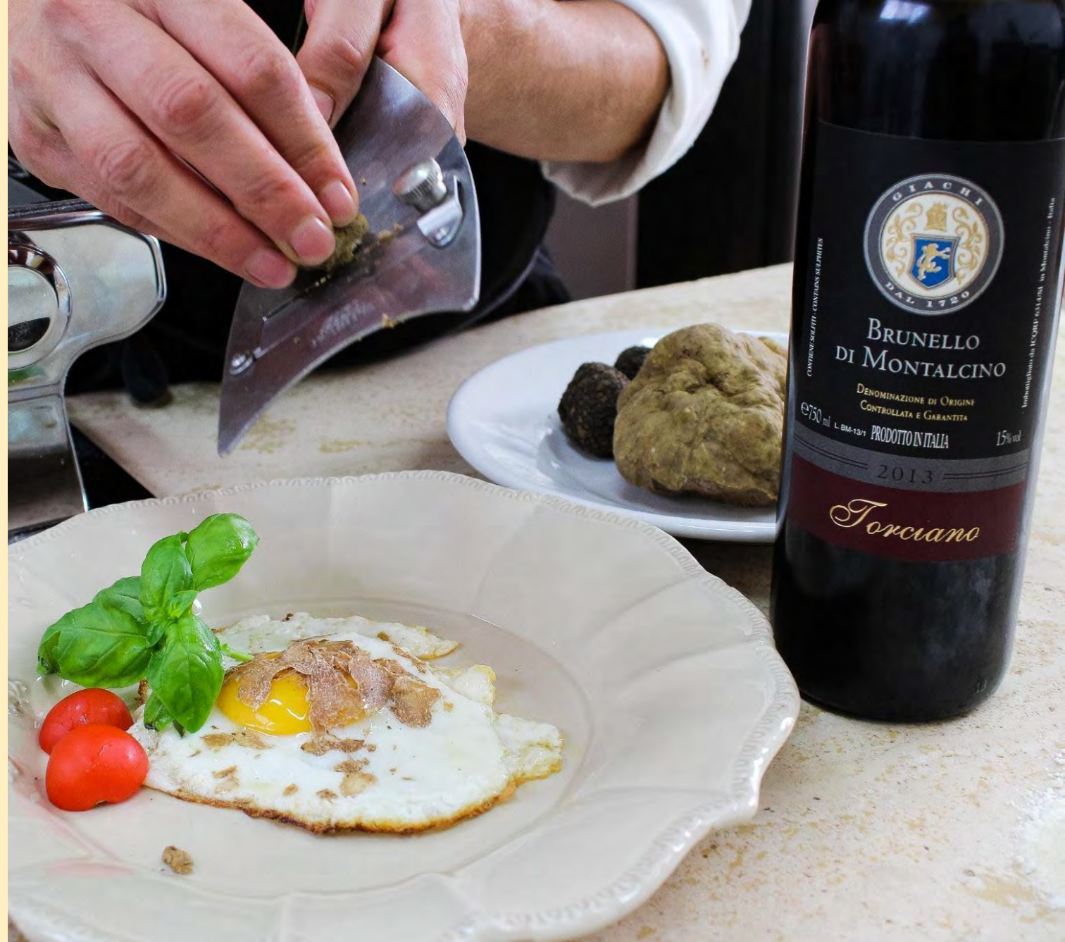
Learn how to use the truffle in your dishes