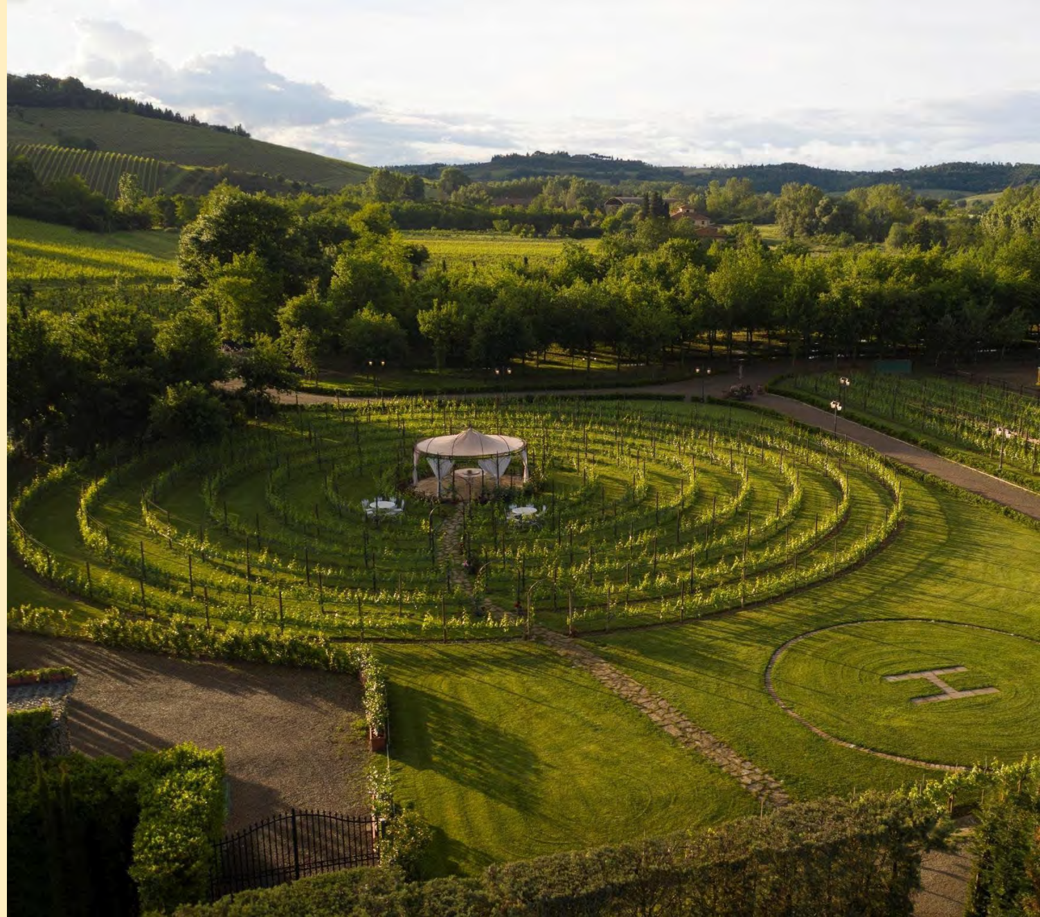
The unique helical vineyard in our Tenuta

Visit and lunch will take around 3 hours.