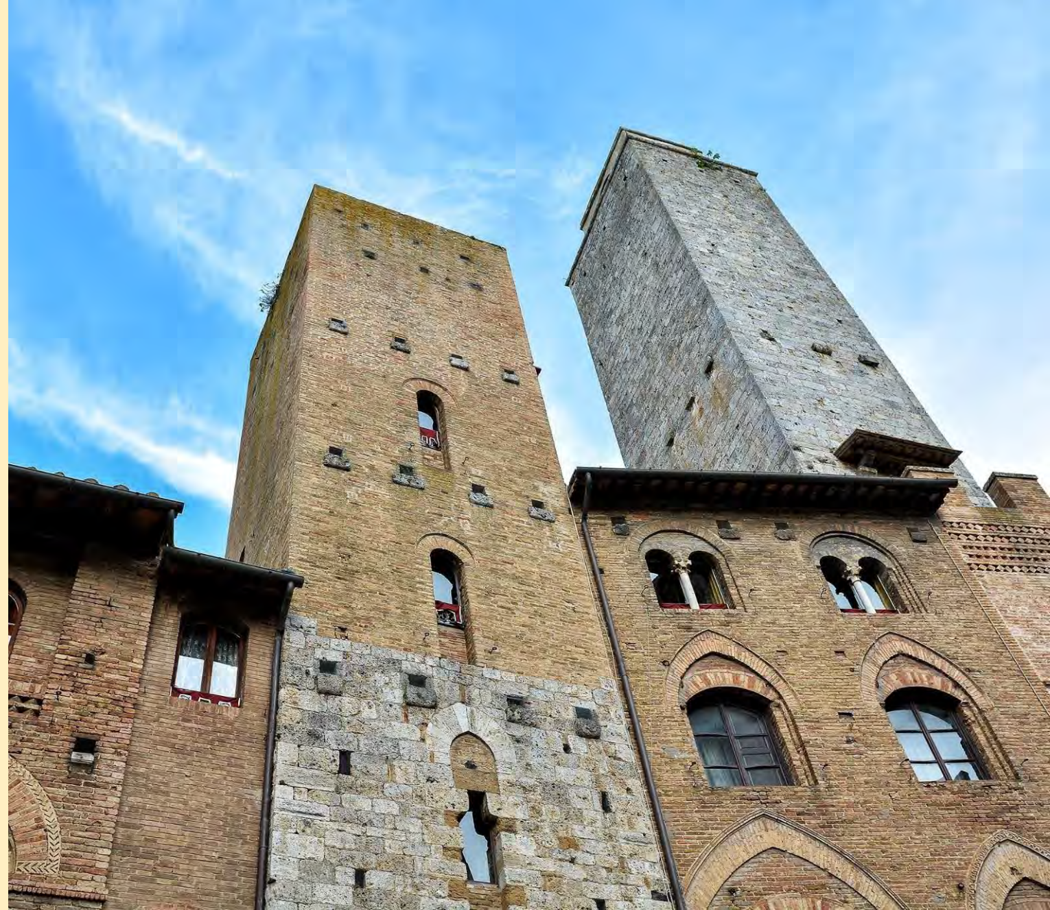
The tower is flanked by medieval buildings of particular value for the presence of mullioned windows with workmanship

The first three floors are covered with stones, with openings to illuminate the low lying arches. On the first floor there is a typical portal accessible via stairs, a legacy of the struggles of medieval life, when they slept in secure buildings with retractable ladders.