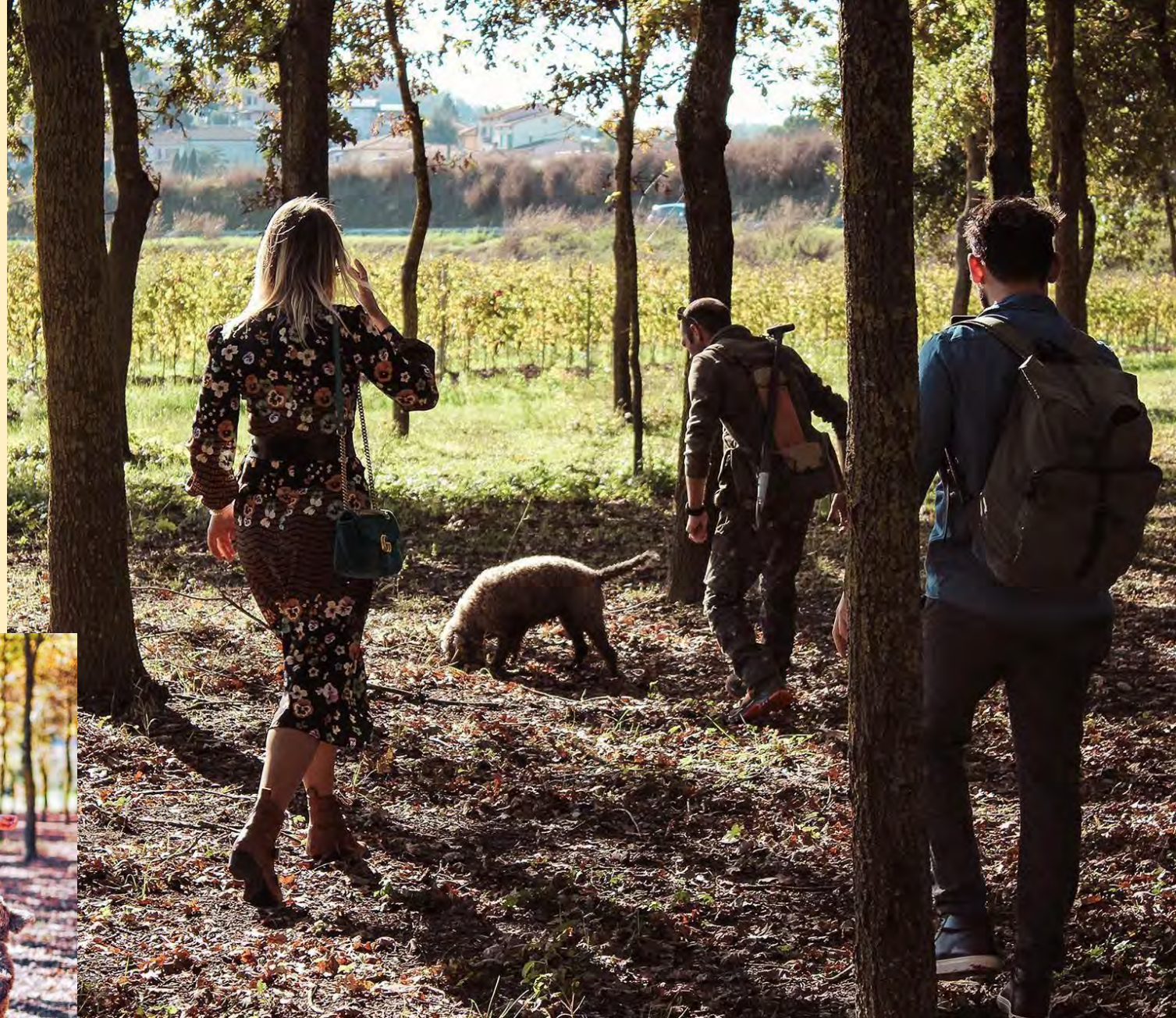
the dogs and find the precious truffles