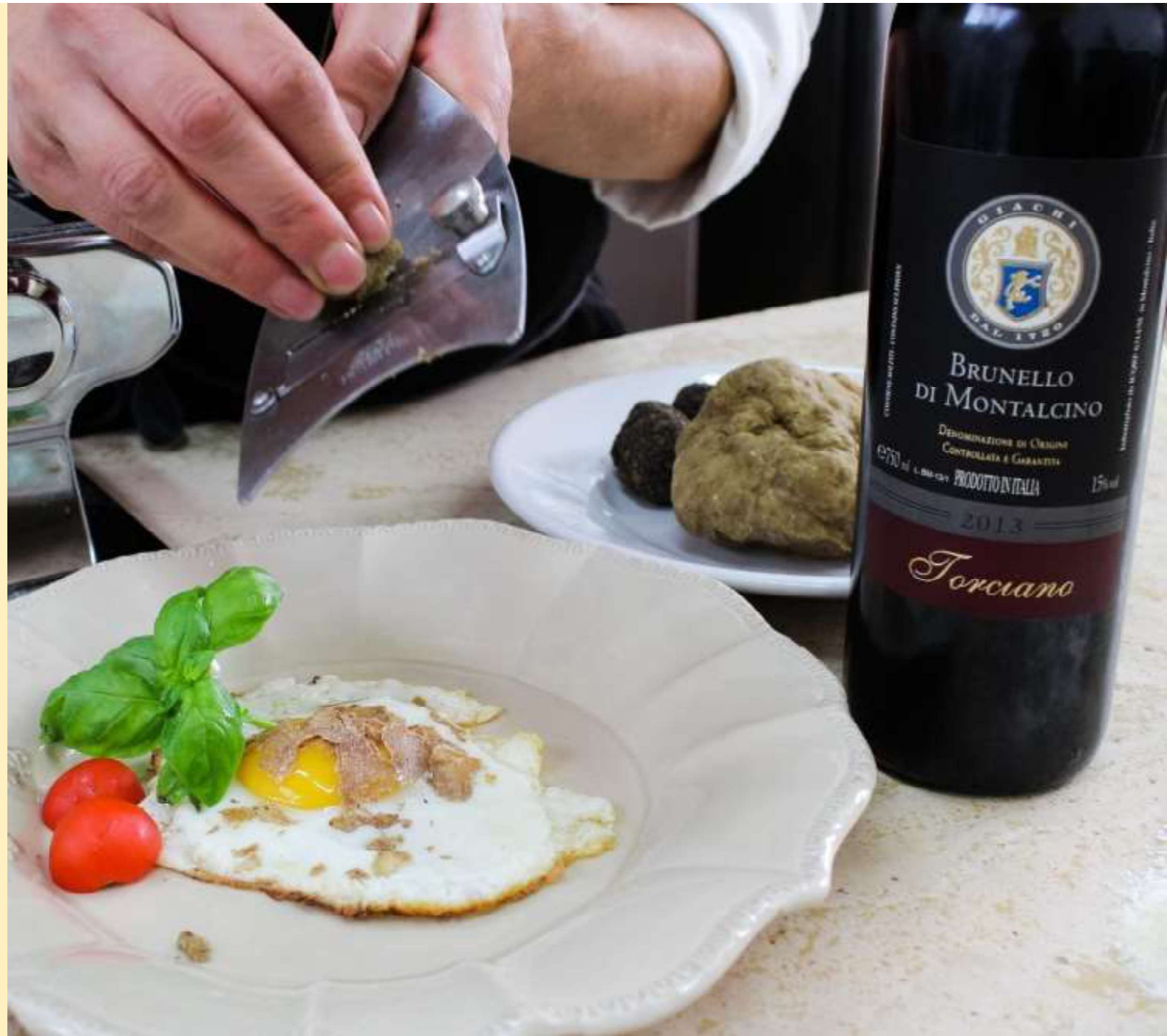
Learn how to use the truffle in your dishes